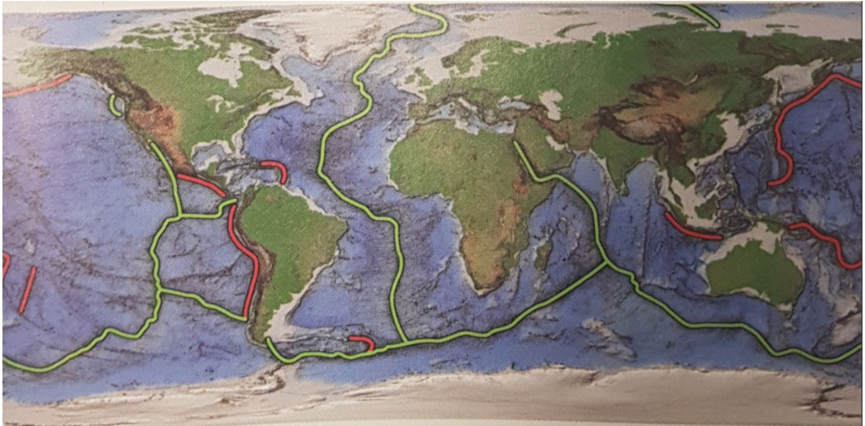
This map shows deep sea trenches (red) and mid-ocean ridges (green).